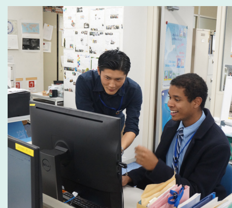
Two interns work collaboratively on a new project.