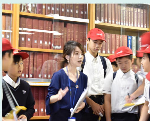
An intern briefs a group of school students on their visit to UNIC Tokyo.