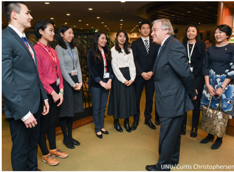
Interns greet Secretary-General António Guterres (centre-right) during his 2018 visit to Tokyo.

"I feel my dream of working at the UN is becoming a closer reality."