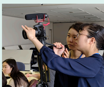
Interns assist with AV set-up before a meeting with representatives of various UN offices in Japan.

"Through interning at UNIC, I have learned how to disseminate information to the Japanese public with accuracy and concision."