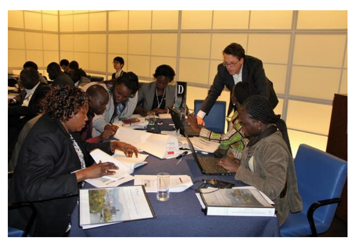
Building the capacity of South Sudanese to be able to effectively identify and address needs in their organizations and community. \odot UNITAR

to address them in ways that will help shape their nation's path towards sustainable recovery and development. The programme has thus far completed two annual cycles with 45 graduates, aiming to develop the capacity of each individual fellow to be a leader. able to contribute to organizational change within his/her respective ministry or organization. One Fellow from the 2015 Cycle identified that there was a lack of skilled teachers in a certain state of South Sudan, and developed a project proposal to train 25 per cent of primary school teachers in the state. This project has been successfully funded and is now being implemented.