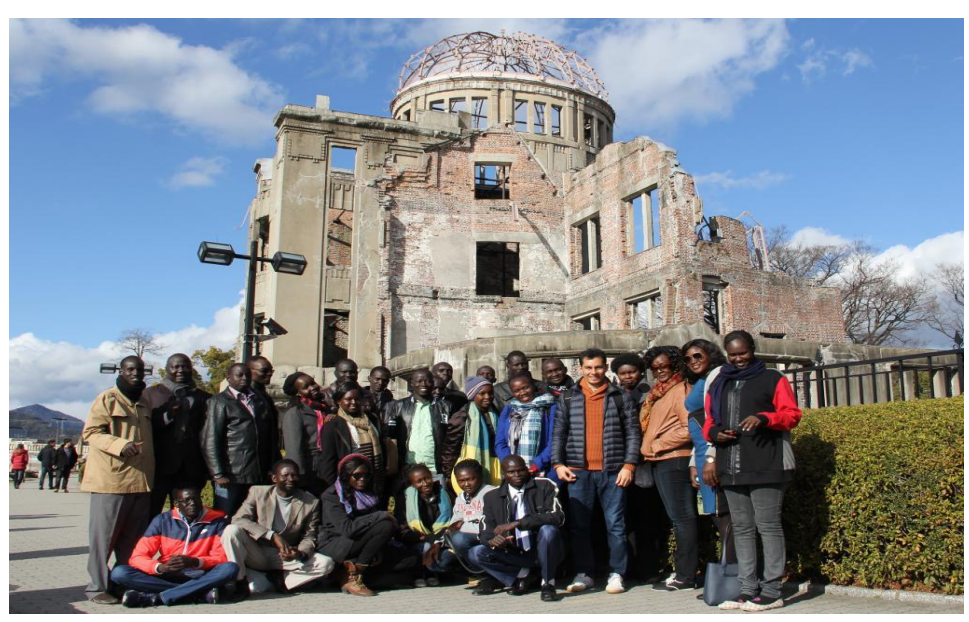
South Sudanese participants study in the City of Peace and learn from Hiroshima's reconstruction story.