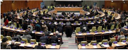
Delegates at the global launch of the International Year of Small Island Developing States, held on 24 th February 2014, at the United Nations Trusteeship Council Chambers.