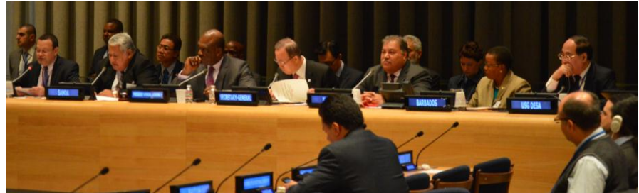
Dignitaries at the Launching Ceremony of the International Year of Small Island Developing States. L-R: Ambassador of Seychelles, Prime Minister of Samoa, President of the UN General Assembly, UN Secretary-General, President of Nauru, Minister of Foreign Affairs of Barbados and Secretary General of the 3 rd International Conference on SIDS.

The United Nations launched the first ever International Year of Small Island Developing States on 24 th February 2014. The year is expected to raise the profile of the SIDS and build momentum towards the Third International Conference on SIDS in Samoa, 1-4 September. The Year was launched with addresses by the President of the Republic of Nauru, the Prime Minister of Samoa, the Minister of Foreign Affairs and Foreign Trade of Barbados, the President of the General Assembly, the Secretary-General of the UN, and the Secretary General of the Third International Conference. The addresses focused on SIDS sustainable development challenges and the expected benefits of the International Year for SIDS. H.E. John Ashe, President of the General Assembly stated that “we must seize the opportunity for the creation of a new vision and the harnessing of fresh commitment and energy for the tasks that lie ahead. The launch of this International Year provides us all with exactly such a pivotal moment.” There is need to recognise the unparalleled ecological and cultural diversity of the world’s small islands developing