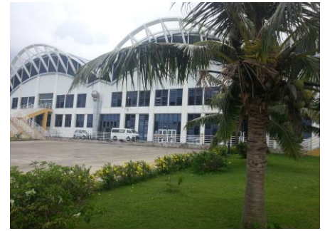
Aquatic centre, venue for accreditation for the Conference

The Samoan government provided a logistical briefing for the Conference on 25 th February at the margin of the first PrepCom. The host country has launched a website that will serve as a centralised booking system for local accommodation for the Conference. Member States were encouraged to finalise accommodation by 30 th June 2014. Accreditation will be done in Samoa and will follow the UN protocol. There will be a series of pre-conference events from 28-31 August 2014, such as the Youth, NGO, Renewable Energy and Private Sector Forum. For more information on the host country preparations, logistics and other relevant information, please visit www.sidssamoa2014.ws .