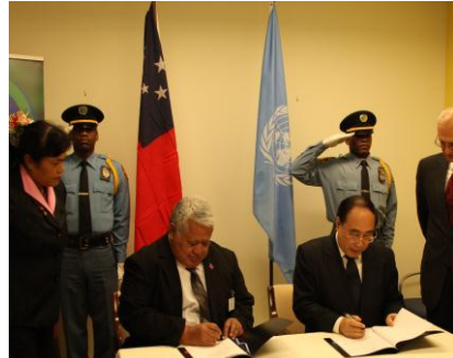
Prime Minister of Samoa and Under-Secretary General of UNDESA signs Host Country Agreement.

The signing ceremony of the Host Country Agreement for the Third International Conference on SIDS, by the Prime Minister of the Independent State of Samoa, H.E. Mr. Tuilaepa Lupesoliai Sailele Malielegaoi, and Mr. Wu Hongbo, UN DESA's Under-Secretary-General and Secretary-General of the Conference, was held on 24 th February 2014.