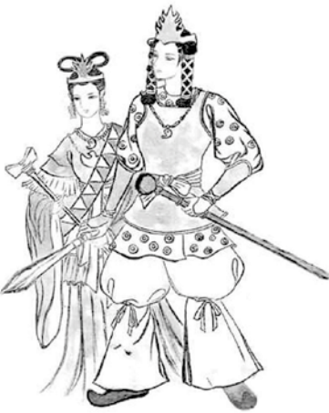
Illustration: Maasa Ota

The Japan Translation Center, Ltd. congratulates the United Nations on the 72nd anniversary of its founding JTC — assisting international exchange through translation