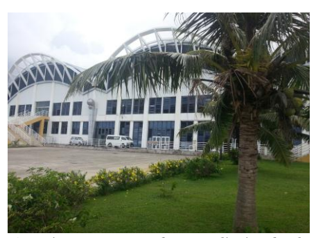
Aquatic centre, venue for accreditation for the Conference

The Samoan government provided a logistical briefing for the Conference on 25<sup>th</sup> February at the margin of the first PrepCom. The host country has launched a website that will serve as a centralised booking system for local accommodation for the Conference. Member States were encouraged to finalise accommodation by 30<sup>th</sup> June 2014. Accreditation will be done in Samoa and will follow the UN protocol. There will be a series of pre-conference events from 28-31 August 2014, such as the Youth, NGO, Renewable Energy and Private Sector Forum. For more information on the host country preparations, logistics other relevant and information. visit please www.sidssamoa2014.ws.