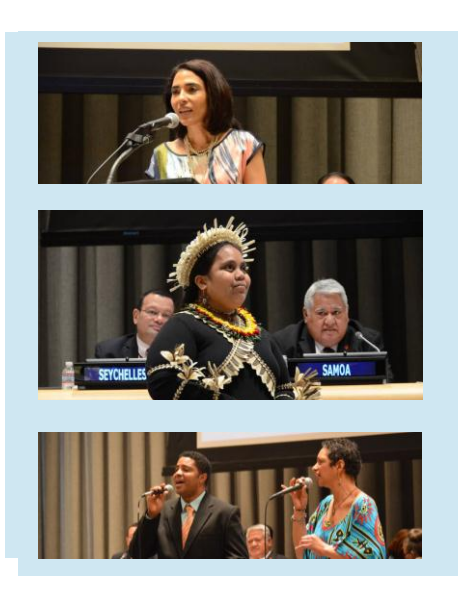
Performers at SIDS International Year Launch

http://www.un.org/en/events/islands201 4/index.shtml#&panel1-1